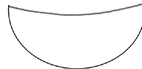
Wings (cut 2)